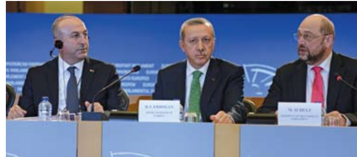
Prime Minister Recep Tayyip Erdoğan and Minister for European Union Affairs and Chief Negotiator Mevlüt Çavuşoğlu with European Parliament President Martin Schulz

As the most eastern part of the West and the most Western part of the East, Turkey enjoys a unique strategic position in its region for geographical, cultural and historical reasons. It is an active player and a credible mediator/facilitator in critical areas such as the Middle East, South Caucasus, Central Asia, the Black Sea basin, Mediterranean and the Balkans.