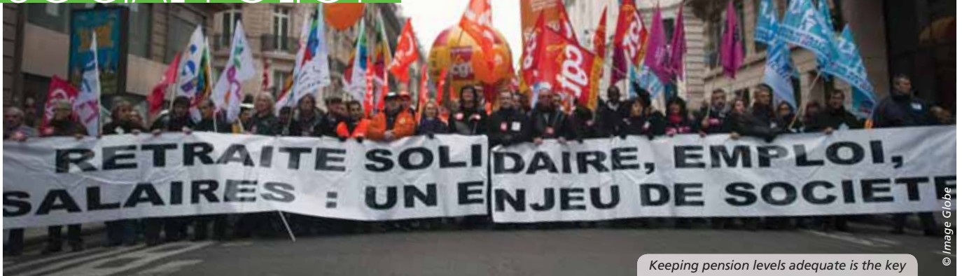
Keeping pension levels adequate is the key