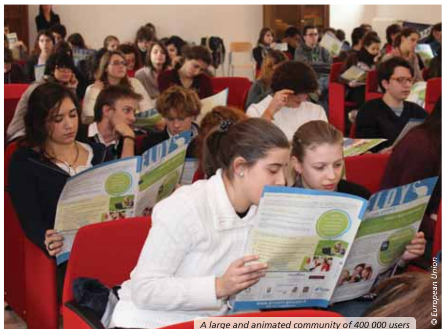
A large and animated community of 400 000 users