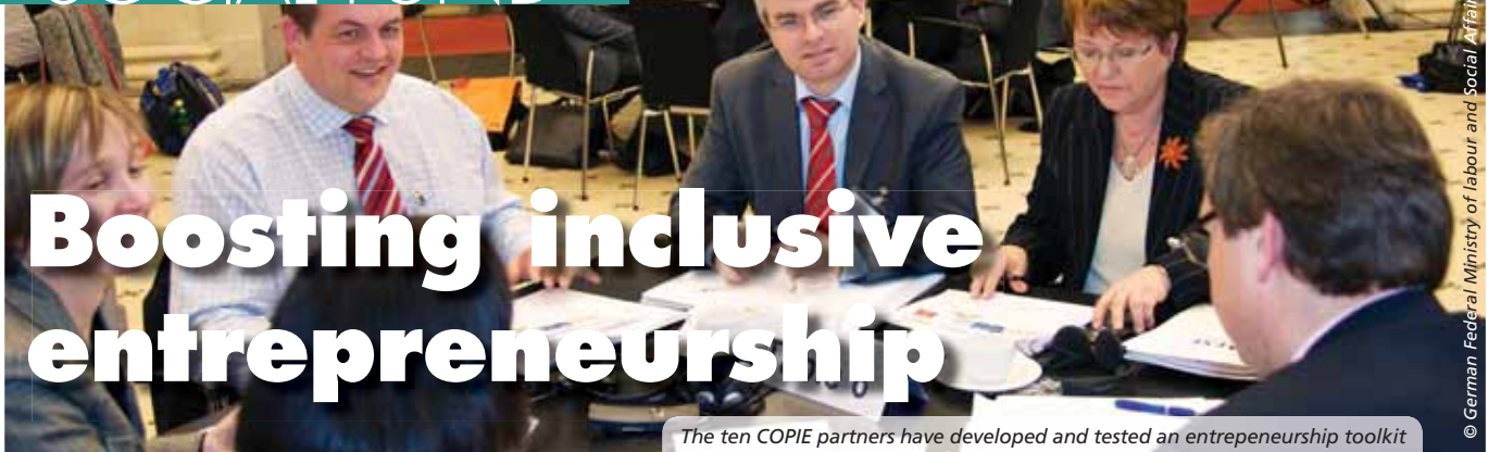
The ten COPIE partners have developed and tested an entrepreneurship toolkit