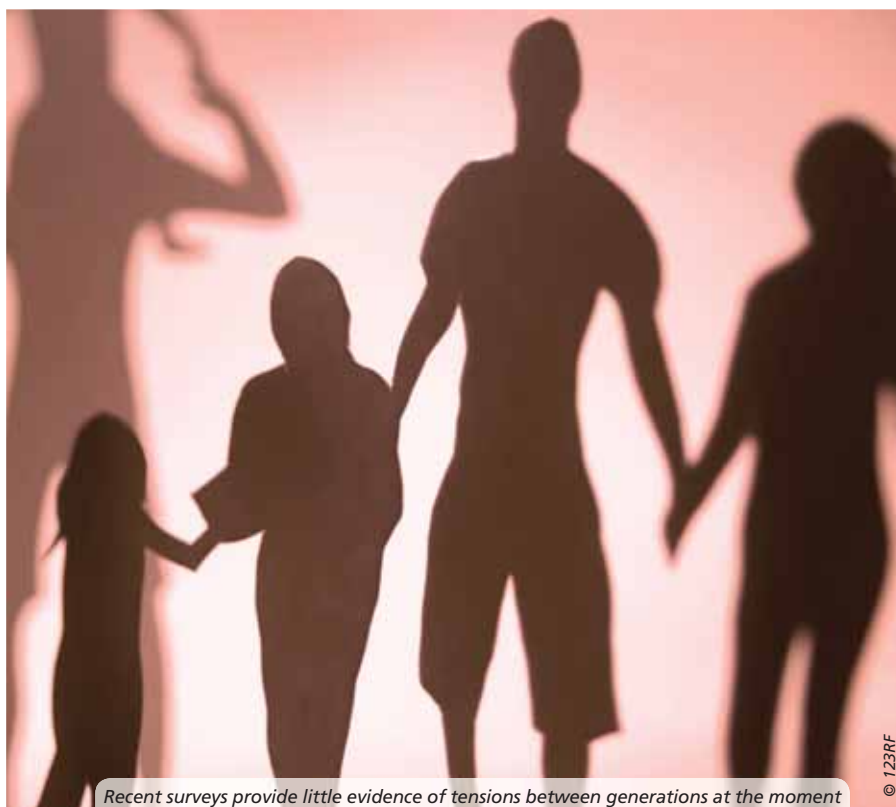
Recent surveys provide little evidence of tensions between generations at the moment