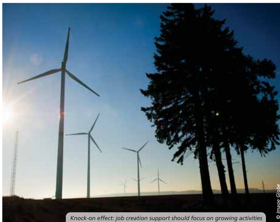
Knock-on effect: job creation support should focus on growing activities

The Commission also proposes that EU social partners be more involved in setting out the main strategic priorities in the area of employment policies. Wage developments in the Member States would be monitored by the Commission, the social partners and the EU Council of ministers, taking into account productivity, inflation, internal demand, unemployment and income inequalities.