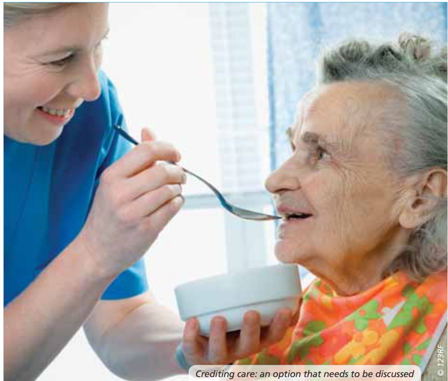
Crediting care: an option that needs to be discussed

The case law of the EU Court of Justice shows that in the field of private occupational pensions,