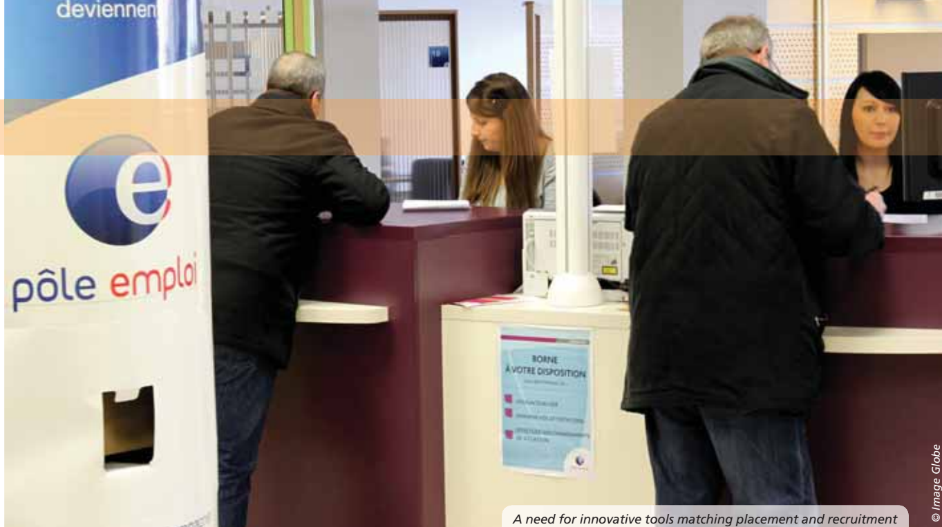
A need for innovative tools matching placement and recruitment