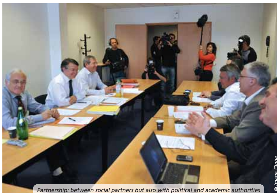
Partnership: between social partners but also with political and academic authorities