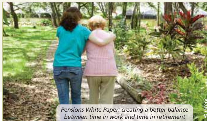
Pensions White Paper: creating a better balance between time in work and time in retirement

The European Commission has published a White Paper on adequate, safe and sustainable pensions which looks at how the EU and the Member States can work to tackle the major challenges that confront our pension systems. It puts forward a range of initiatives to help create the right conditions so that those who are able can continue working – leading to a better balance between time in work and time in retirement; to ensure people who move to another country can keep their pension rights; to help people save more and ensure that pension promises are kept and people get what they expect in retirement (full article p.12). ■