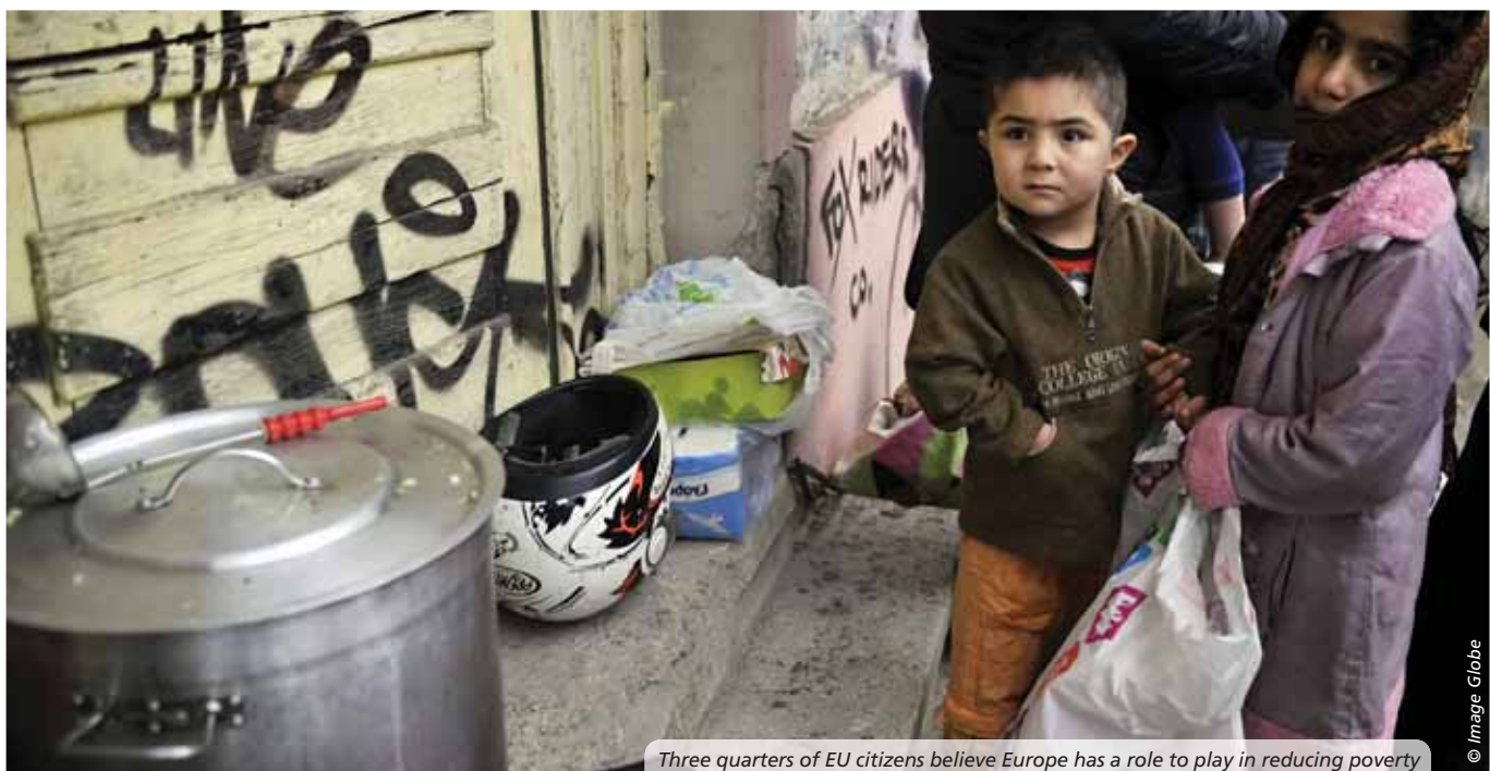
Three quarters of EU citizens believe Europe has a role to play in reducing poverty

The European Commission supports efforts and progress towards the poverty reduction target. To this end, it has adopted a European Platform against Poverty and Social Exclusion, to be managed by DG EMPL. The Platform aims to create a joint commitment for action between Member States, European Union institutions and stakeholders, and to help coordinate a wide range of partners in the fight against exclusion, including in the field of health and e-inclusion. It puts forward ideas for innovation and improvements that can help everybody work more effectively, focusing resources where they make the most impact.