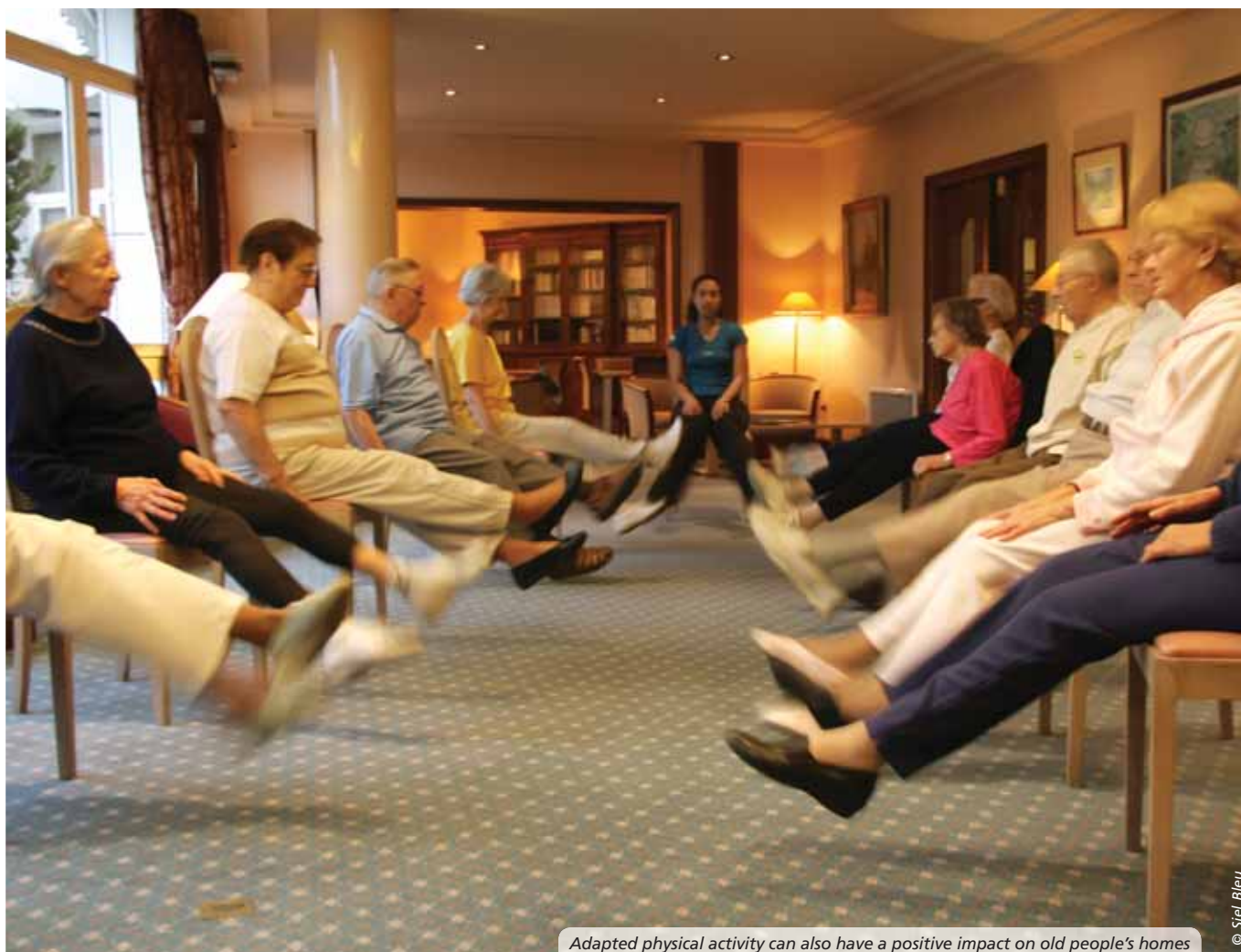
Adapted physical activity can also have a positive impact on old people's homes

An overall cost analysis of the programme will be carried out. On this basis, new financial models will be designed and new financial sources identified for physical activity prevention programmes. If the outcome of the study is positive, it could become part of a Europe-wide public health programme.