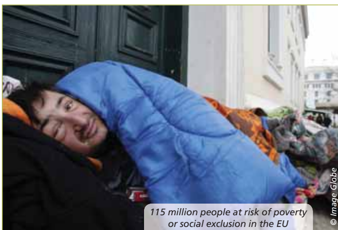
115 million people at risk of poverty or social exclusion in the EU