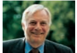
Christopher Patten European Commissioner responsible for external relations

For all the above, I cannot but be optimistic for the future of the Barcelona process.