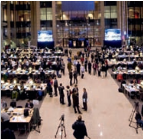
The press centre at the Justus Lipsius building, during a meeting of the European Council.

Aside from logistical and organisational matters (meeting rooms, document production, translation, etc.) the General Secretariat assists in the preparation for Council meetings, helps to see that they run smoothly and then contributes to follow-up. It does the same for the Committee of Permanent Representatives (Coreper) and for preparatory bodies, providing presidencies with the necessary support to achieve their objectives.