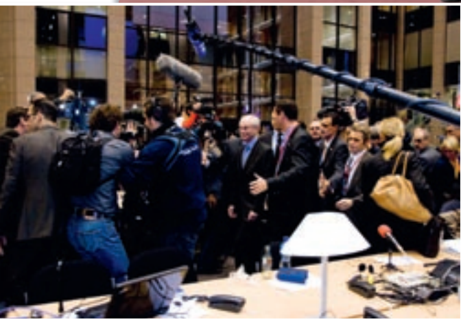
Herman Van Rompuy at the Council press centre on 19 November 2009, on his election as President of the European Council