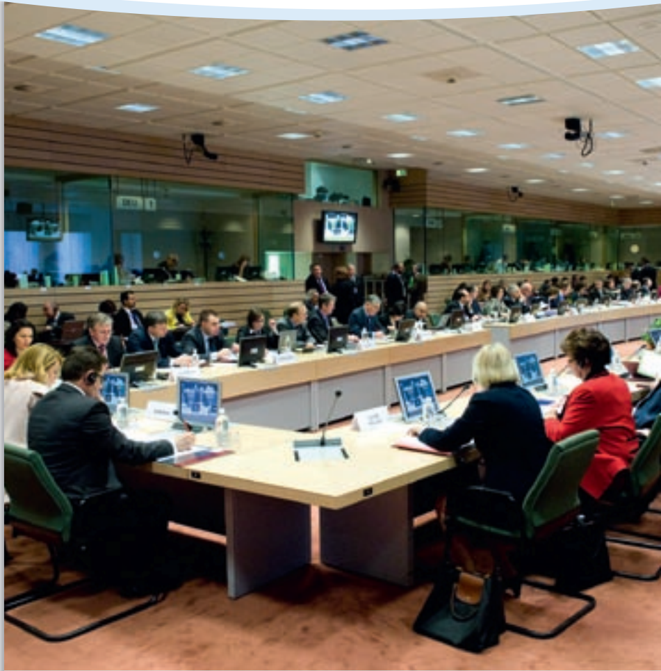
The farm ministers of the 27 Member States at a meeting of the Agriculture and Fisheries Council