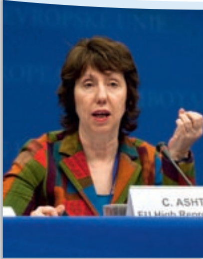
Catherine Ashton, High Representative of the Union for Foreign Affairs and Security Policy and President of the Foreign Affairs Council

Only one Council configuration is not chaired by the six-monthly presidency: the Foreign Affairs Council, which, since entry into force of the Treaty of Lisbon, has been chaired by the High Representative of the Union for Foreign Affairs and Security Policy. Since 1 December 2009 this post has been held by Catherine Ashton. Roughly 20 working parties in the foreign affairs field also have a permanent chairman appointed by the High Representative.