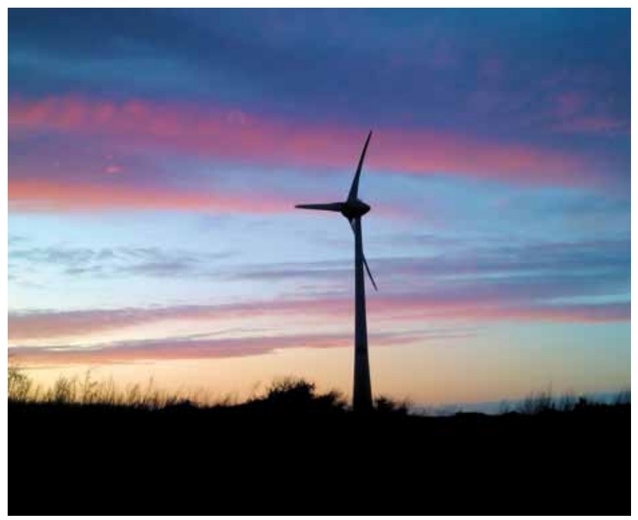
Estinnes wind farm, © European Union/Mario Dionisio

Assuming that the initiative will be supported by a comprehensive research programme to bring about constant improvements in wind energy systems, the cost is estimated at €6 billion over ten years.