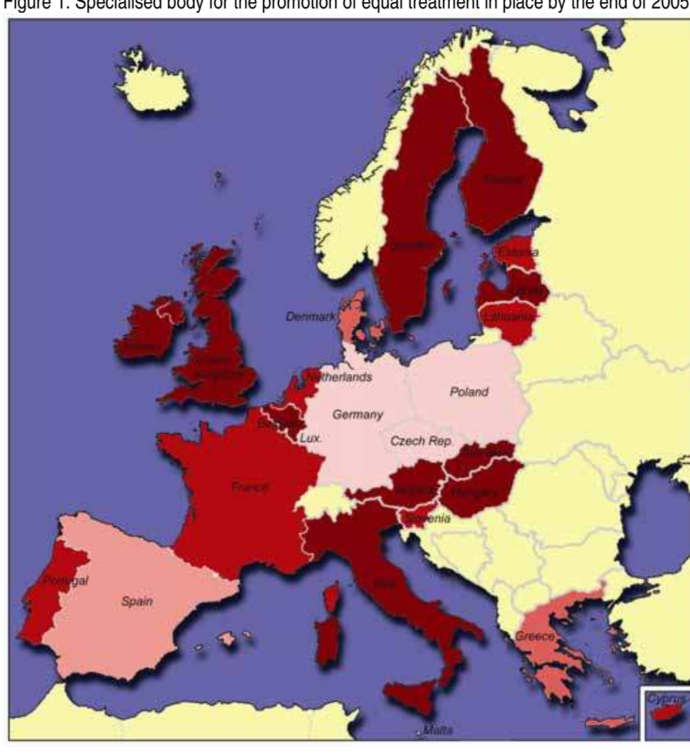
Figure 1: Specialised body for the promotion of equal treatment in place by the end of 2005