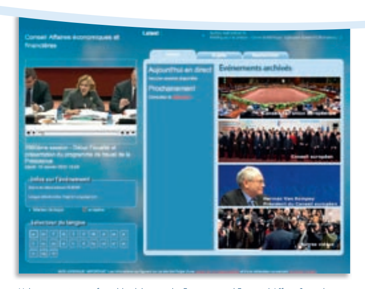
Video transmission of a public debate in the Economic and Financial Affairs Council on the Council's Internet site