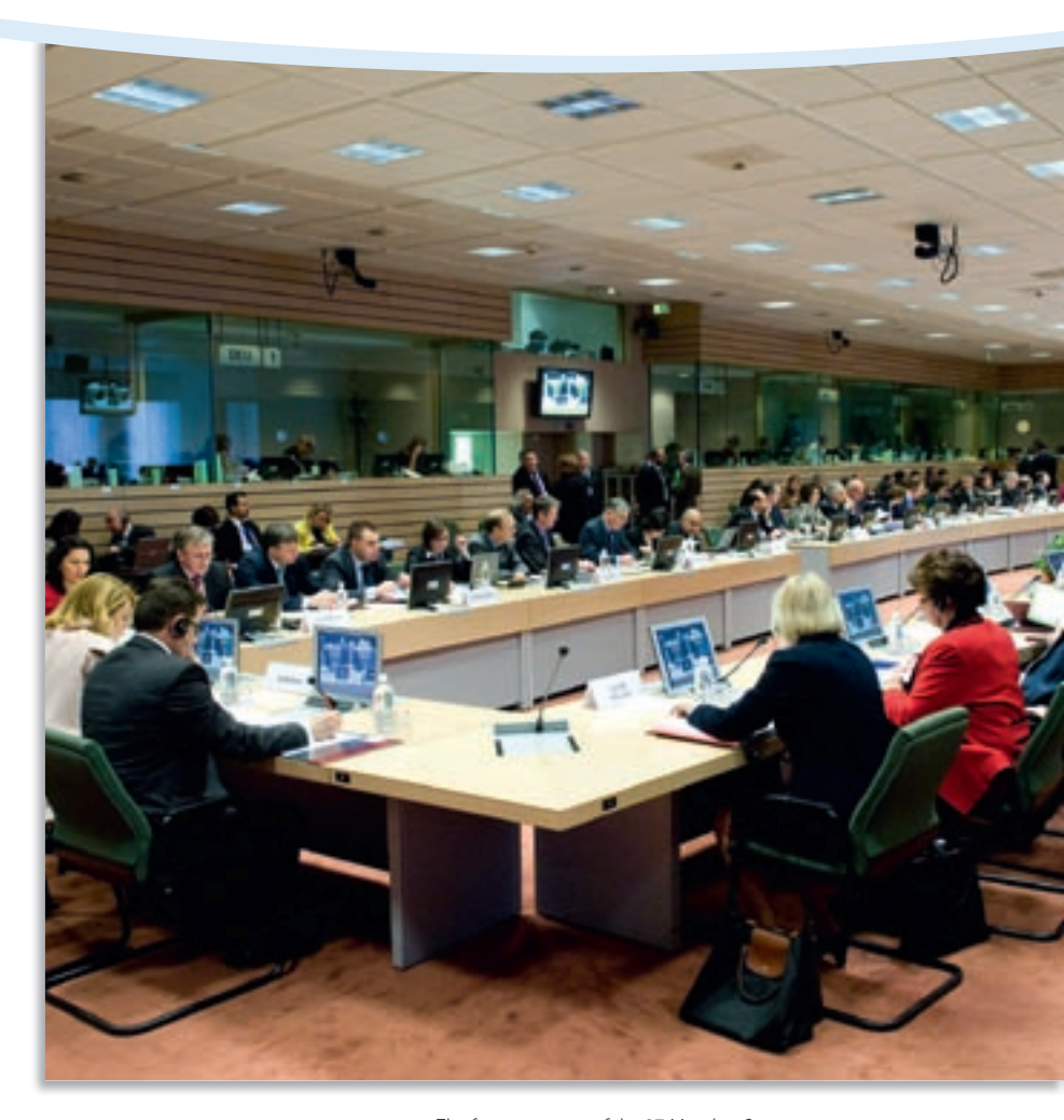
The farm ministers of the 27 Member States at a meeting of the Agriculture and Fisheries Council